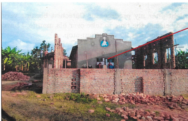
The second old church

With raising standards and growing faith in Christ the Christians are building yet another bigger and better church around the old one. Our prayer is to strengthen the hearts of the faithful.