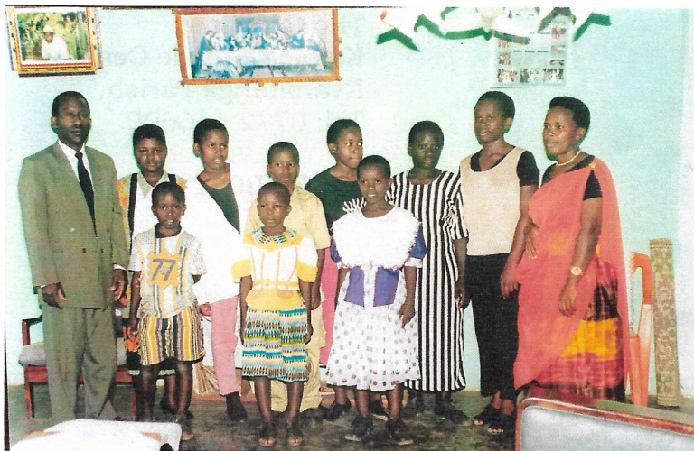
The family and two adopted children

I started serving from a small old church below: